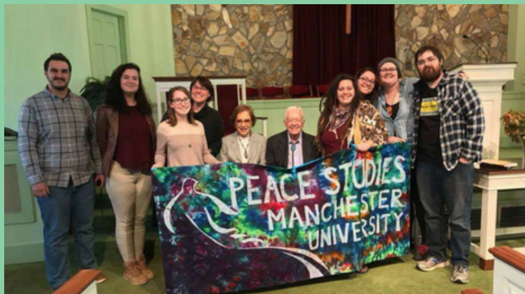
Jimmy and Rosalynn Carter with a group of students from Manchester University

Jimmy and Rosalynn Carter have left an indelible mark on Habitat for Humanity through decades of tireless advocacy and hands-on involvement. Their dedication began in 1984 with the Carter Work Project, an annual event where they led volunteers in building and repairing homes for families in need. The Carters' unwavering commitment brought global attention to the cause of affordable housing, inspiring countless individuals to join the mission. Their leadership and compassion have helped build, renovate, or repair thousands of homes worldwide, transforming the lives of families and strengthening communities. Their legacy with Habitat for Humanity continues to embody the spirit of service and the belief that everyone deserves a safe, decent place to live.